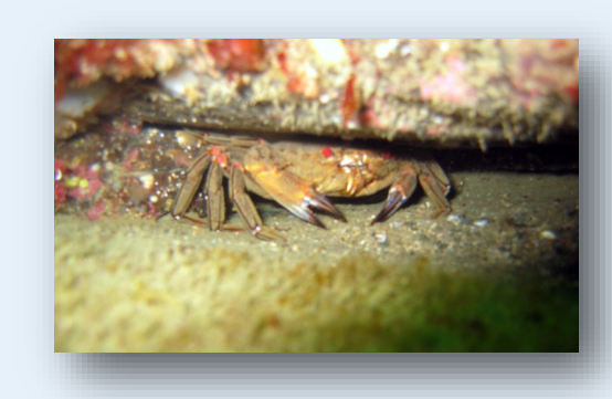
Inhabitant of Porthkerris